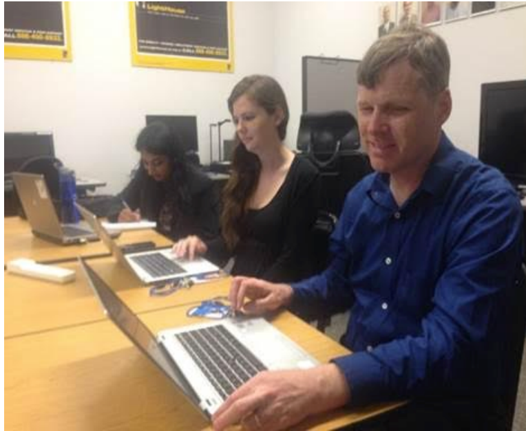
Our user completing a task on the National Treasury Website as we take notes.

We recorded our observations and after completing several usability testing sessions, we created a report listing the faults in section 508 and web content accessibility guidelines (WCAG 2.0) requirements.